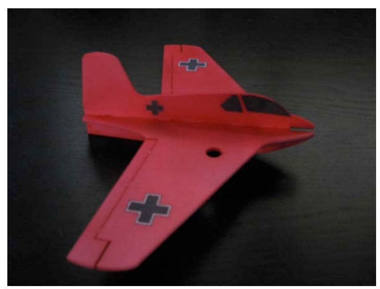
*Be careful when using CA accelerator after coloring your model. It often can remove paint that's not completely dry.

6. Use foam safe CA to glue the 7mm motor into its cutout in the nose. One drop of CA on each of the four edges is enough to secure the motor while allowing it to be removed for replacement. When gluing, check that the motor is centered in the mount and not pointed upwards or downwards. Slightly angling the motor to the right is optional, but it can reduce the effects of the motor torque on the model's flight. Once the glue is dry, press a Tri-Turbofan propeller onto the motor with the convex side facing outward.